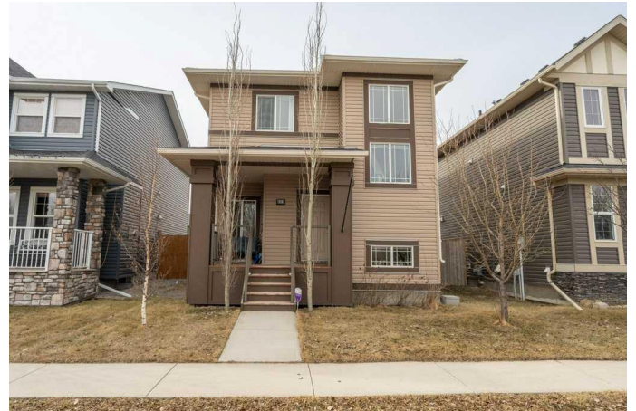
14 Ravenskirk Ct SE, Airdrie, AB

Main Floor Exterior Area 714.82 sq ft Interior Area 650.27 sq ft