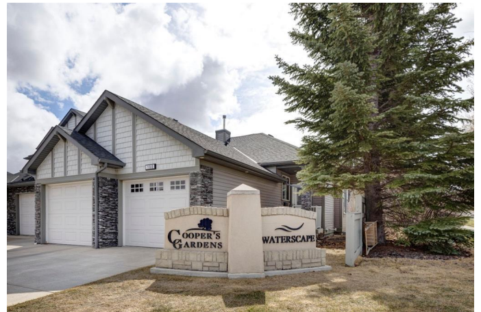
160-100 Coopers Common SW, Airdrie, AB

Step into the vibrant heart of Coopers Crossing and claim this rare end-unit bungalow villa, where modern elegance meets unbeatable location. Backing onto the community's scenic pathway system, this home boasts a sun-drenched south-facing deck and yard—perfect for savouring morning coffee or evening sunsets. Inside, meticulous care and recent upgrades elevate every moment. Refaced cabinet doors and drawers gleam in the kitchen, where a sleek moveable island invites culinary creativity. Hardwood flooring has been extended to flow seamlessly from the main living areas into the kitchen and two bedrooms, creating a cohesive, polished look. The main floor is a masterclass in functionality, with the kitchen leading to a spacious dining room, while the living room beckons with a cozy gas fireplace and patio doors that frame the deck's inviting views. A practical mudroom/laundry area connects to the double attached garage, ensuring convenience. Retreat to the primary bedroom, complete with a walk-in closet and a 3-piece ensuite, or host guests in the second bedroom with easy access to another full bathroom. Downstairs, possibilities abound. A spacious recreation room, bathed in natural light from two large windows, sets the stage for movie nights or game days. A third bedroom and full bathroom offer flexibility for guests or family, while an unfinished hobby space or workout room awaits your personal touch. Enjoy year-round comfort with a furnace and water